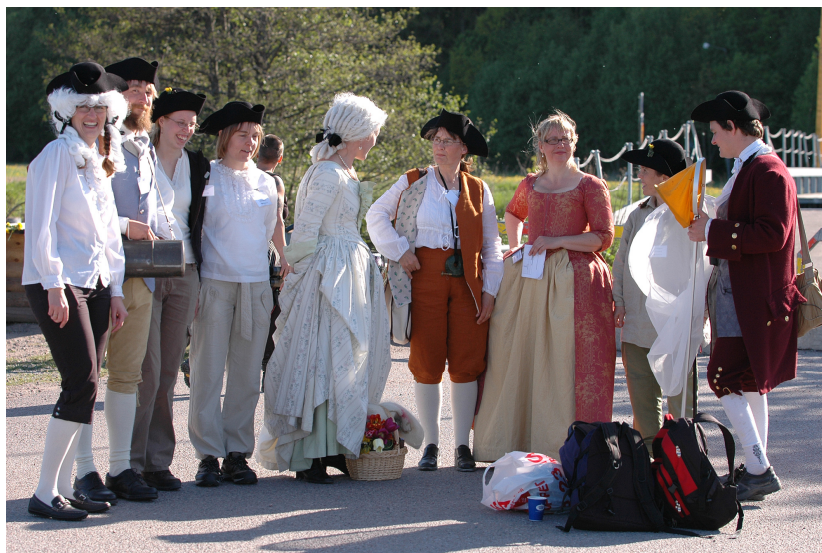
Fig. 2. To the Linnaeus Tercentenary in 2007 guides were educated in Linnaeus' teaching methods. They dressed up in eighteenth century style clothes and had excursions on the restored excursion trails of Herbationes Upsalienses .

Since 2002, a course called “Linnaeus: Life and Sciences” has been given at Uppsala University to test the results from our research project. 55 In this course, known qualities of Linnaeus as a teacher have been brought “alive.” The teachers selected are all “good teachers” with a great enthusiasm for their science. They have been encouraged to use “old-fashioned” methods in teaching, e.g. their voice only. Talks given by Linnaeus have been read out loud by an actor in a lecture hall used in the 1740's for medical lectures. The students have been prepared with a thorough lesson in