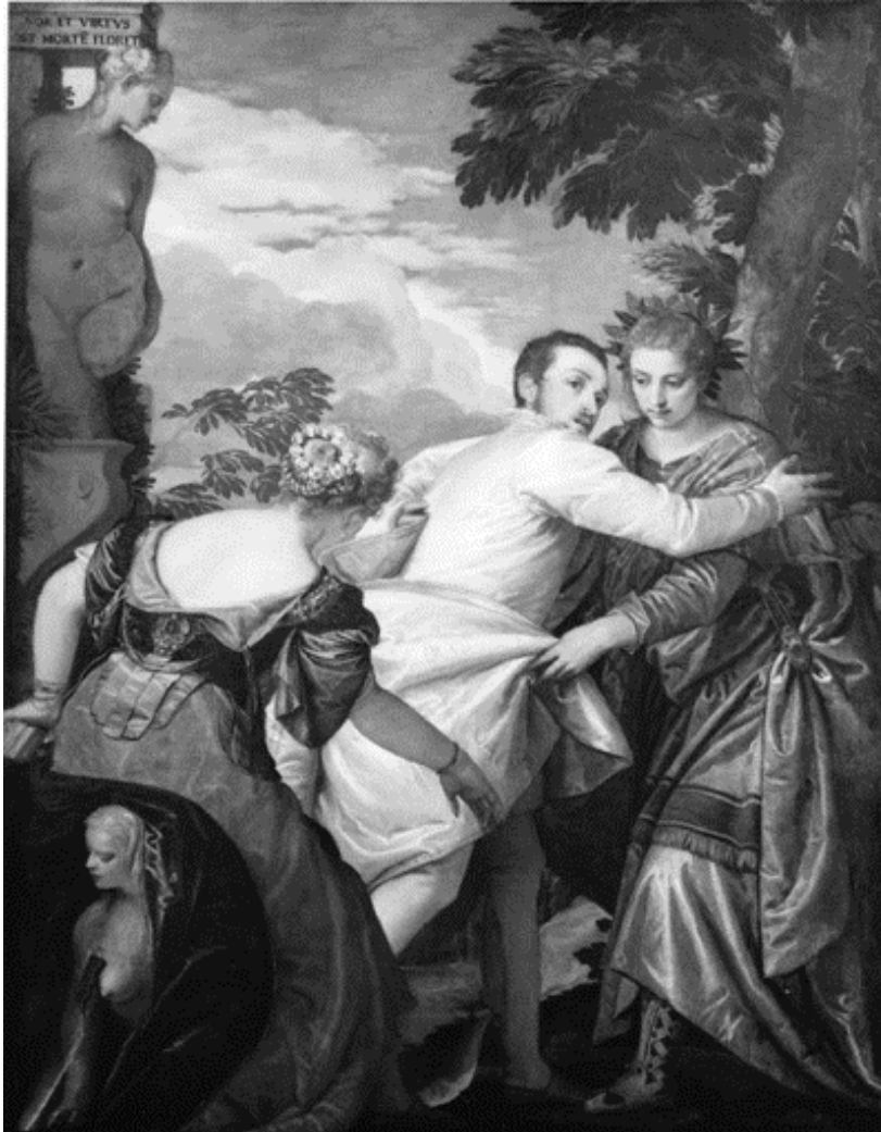
Figure 4: Veronese's Allegory of Virtue and Vice (The Choice of Hercules) .