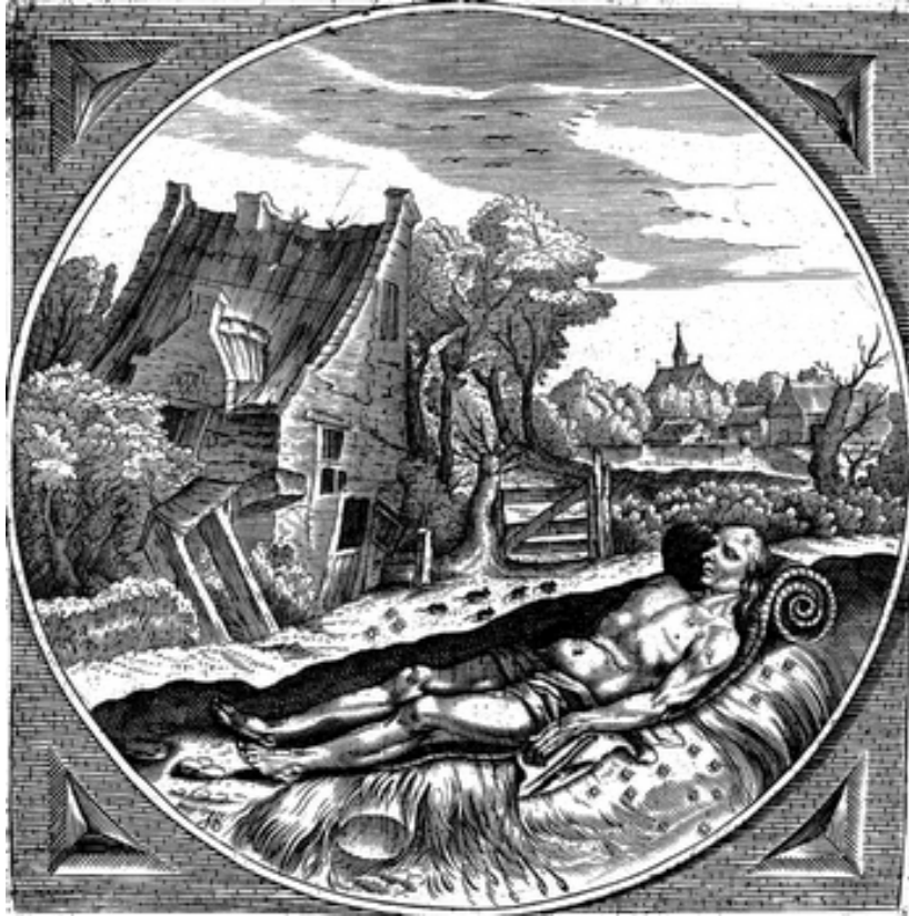
Figure 3: From Jacob Cats, Sinne- en minnebeelden (1627). Emblem project Utrecht, 2002.