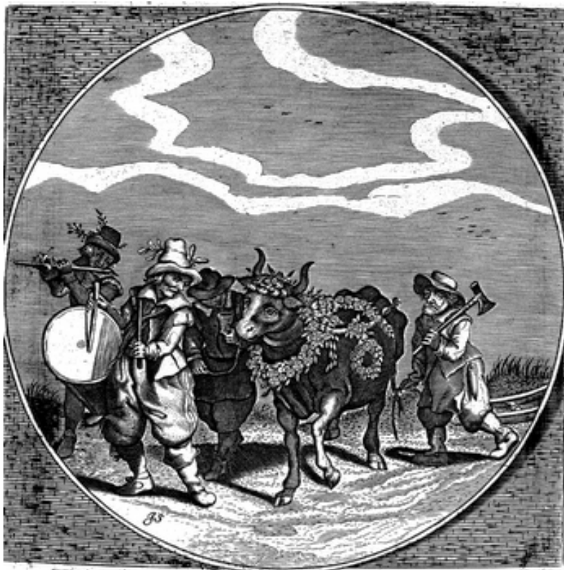
Figure 1: From Jacob Cats, Sinne- en minnebeelden (1627). Emblem project Utrecht, 2002.

as the previous emblem. 15 This time Fru Lusta verbally paints the picture of a spider web in which mosquitoes become ensnared, but wasps escape. Fru Lusta supplies the explanation that the spider web is like the law; the poor and unfortunate are caught, but the powerful go free.