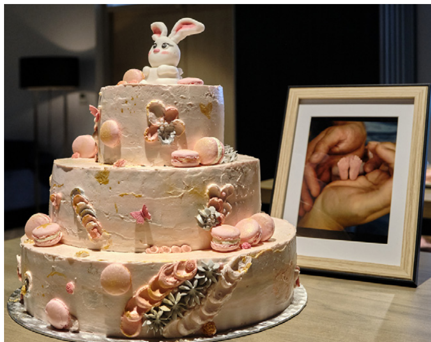
Figure 1. This photograph captures the pink birth cake of Celine, decorated with macarons and a bunny on top. Next to the cake, a photograph is positioned. In the image you see Celine's feet amidst her parents' hands.