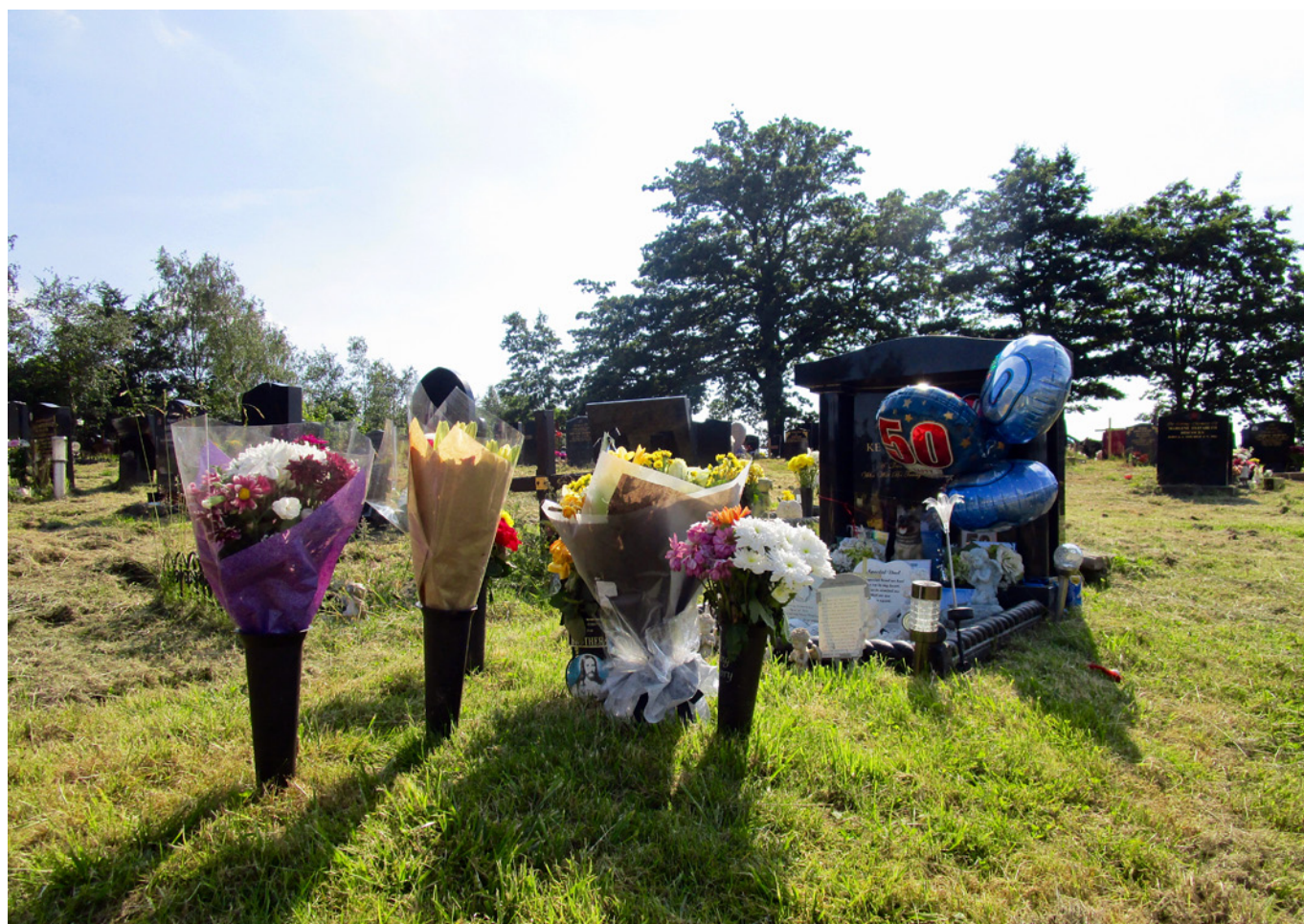
Figure 4. Balloons and birthday flowers at a grave, celebrating the 50th anniversary of the deceased, Wales, 2018.