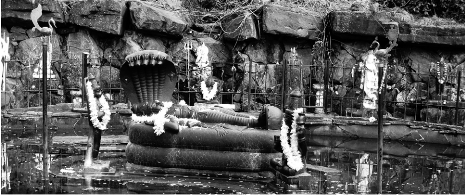
Illustration 7: Skanda Vale, Wales