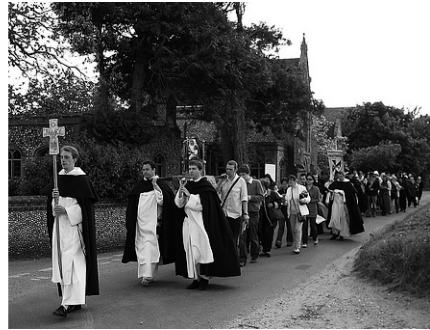
Illustrations 1-2: Anglican and Catholic Pilgrimage, Walsingham

During the twentieth century pilgrimage shrines continued to increase as Catholic priests in particular showed considerable entrepreneurial skills in seizing opportunities to link famous European shrines to local needs. A copy of the grotto at Lourdes, for example, was built by unemployed miners during the 1920s at Carfin, Scotland, so that local Catholics could be involved in the cult even if they could not travel to Lourdes itself. Pilgrimages undertaken by members of the Established Church – the Church of England – also began to develop. The most celebrated example is the Marian shrine at Great Walsingham in East Anglia, which was revived in 1931 through the efforts of ‘High Church’