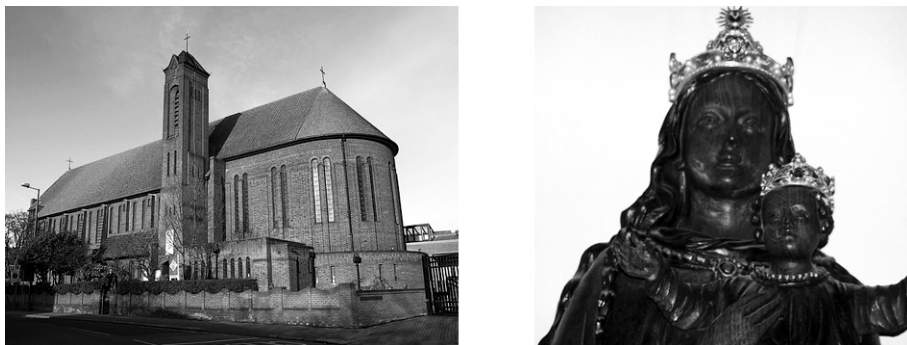
Illustration 4-5: Our Lady of Willesden, Catholic Church and Statue

Hence, an enquiry for Marian shrines in England through an internet search engine such as Google reveals the presence of eighteen sites across the country.