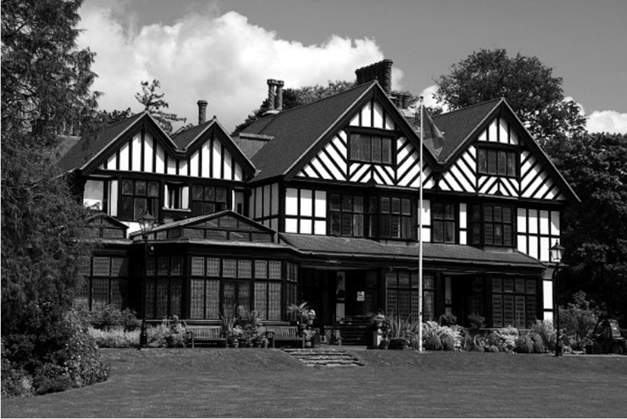
Illustration 6: Bhaktivedanta Manor

Hindus have played the most part in this development. As early as the 1980s there was evidence of Hindus going on local pilgrimage, viz. the study of a Satya Sai Baba pilgrimage by Bowen. 23 One of the most prominent shrines was established in a substantial mock-Tudor house north of London by ISKCON (the International Society for Krishna Consciousness), which had attracted many white British converts [see Illustration 6]. During the 1960s ISKCON has moved much closer to local Hindu practices. The Bhaktivedanta Manor's reputation for miracle was linked to its emergence as a pilgrimage center. 24 However, the presence of what many inhabitants nearby regarded as an exotic intrusion into the English countryside did not go unchallenged. During a planning dispute over the use of the site ISKCON had to call on all its connections with local and national political elites to prevent the shrine from being closed down. 25