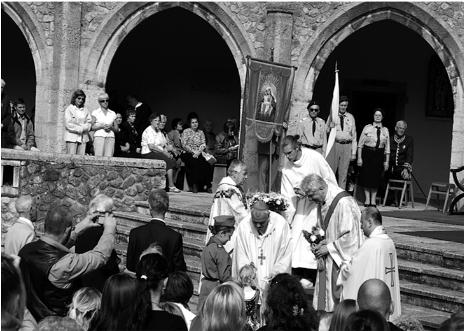
Illustration 3: Aylesford and Polish Migration

clergy but also saw the emergence of Catholic pilgrimage to the Slipper Chapel outside the village [see Illustrations 1 and 2]. After the Second World War pilgrimages have not only expanded further but also attracted in some cases a multicultural audience. The Marian shrine at Aylesford near the Anglican cathedral at Canterbury was developed during the late 1400s by the Catholic order of Carmelites and Poles, who had fought in the war and chose to remain in Britain, established two pilgrimages there [see Illustration 3] and other minorities began to come to the shrine so that celebrations are now held by Tamils, Goans, Keralans, Nigerians, African-Caribbeans, Italians and Portuguese. At Walsingham the Orthodox Church also became involved by establishing a chapel in the Anglican shrine when it was built in 1931 and then converting a former railway station nearby into a chapel in 1967.