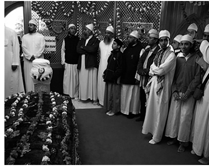
Illustration 10-11: Muslim Shrine, English Midlands

Like British Hindus, Muslims are also encouraged to engage with sacred virtual space through internet sites and virtual communication. While they may identify with both a global Islam ( umma ) and local cults, the growth of cyber Islam also supports the individualization of religion through people's ability to 'pick and mix'. These mixtures of global and local, universal and particular, physical and virtual space are also encouraged by the interweaving of Sufi and Western music, which are popular among many British Muslims within the second and third generation.