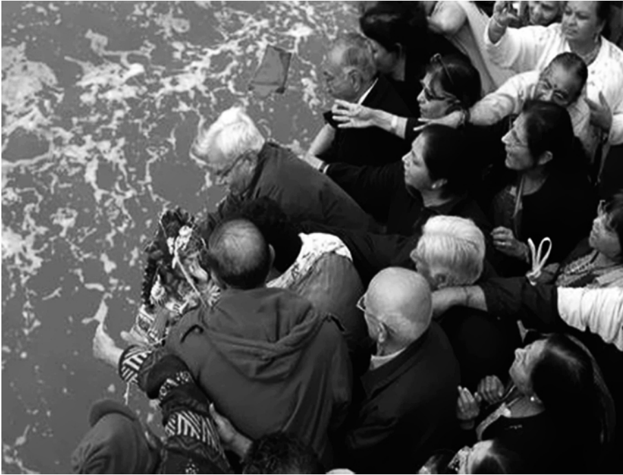
Illustration 9: Ganesh Ceremony, Liverpool

Switzerland and New Zealand. They also used the internet to make the dispute an international one. The bull was eventually taken away for slaughter but the controversy highlighted the interweaving of different interests and principles operating at local and more global levels, such as the role of the state, European law, pressure groups, the sacred role of animals, the sanctity of life within Hinduism and the desecration of a sacred place.