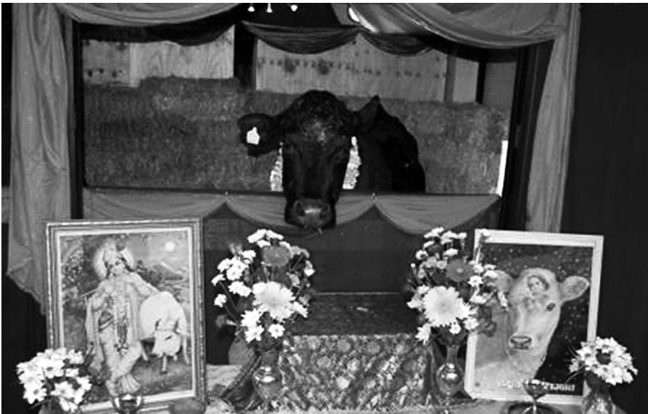
Illustration 8: Skanda Vale, bull

Its website describes monastery as including ‘both monks and nuns who take Franciscan vows of poverty, chastity and obedience, as well as some resident lay members’ and providing ‘spiritual refreshment to a large number of devotees living both in Britain and abroad’. 26 The monastery supported a farm where in 2007 one of its bulls became sick and a government department requested that the animal be put down [see Illustration 8]. The monks challenged the official request, which was supported by the National Union and local government officials, and drew on their wide range of support with people coming from