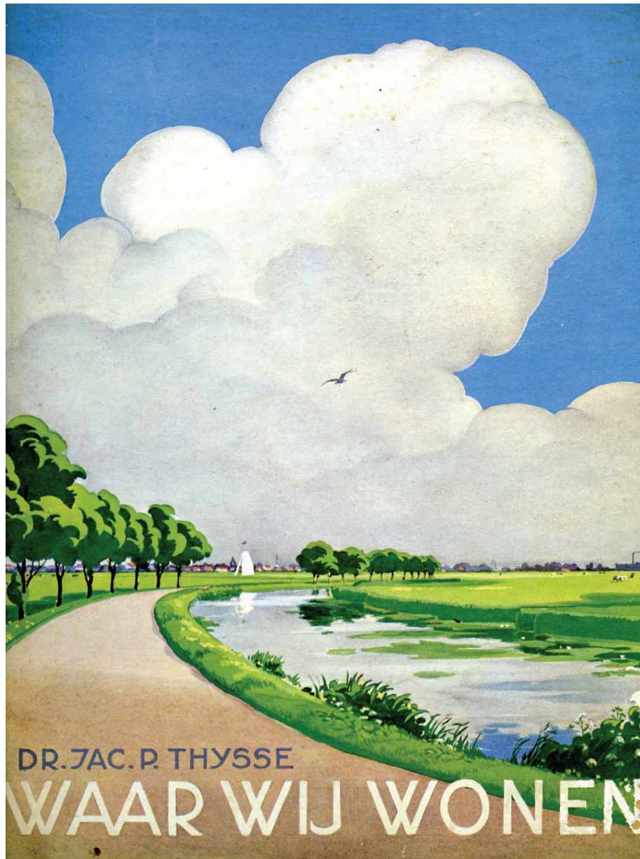
One of the famous Verkade Albums by Jac. P. Thijssse