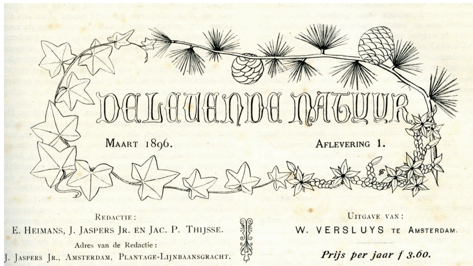
First issue of 'De levende natuur'

booming and required new areas, railways crossed the countryside and the deformation of towns created opportunities for the rapid extension of these towns. Growing numbers of people feared that what was left of nature would disappear completely and founded organisations for the protection of nature, plants and animals.