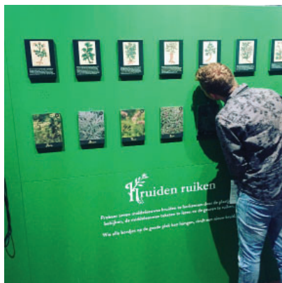
Figure 2: 'guessing the herb game'.

Although the museum claims the exhibition to be large (it does exhibit more than 200 objects), it felt rather small. It took about 1 hour to walk through it, and afterwards I wished it had been more extensive. Notwithstanding, it is of perfect length in combination with a visit to the Hortus Botanicus, or any other temporary or permanent exhibition in the museum. While the range of objects on display is very diverse, and some digital tools are incorporated (e.g. a screen on which you can browse through a medieval encyclopaedia of herbs and plants), the interactivity of the exhibition is limited. This is still very much a conventional, and thus passive, historical exhibition. Nonetheless, there are two interactive elements worthy of mentioning, that also include a playful element, which the historian Steve Poole, specialized in digital media, game and history from below (and interested in transforming