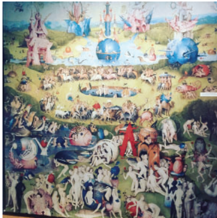
Figure 1: Hieronymus Bosch, The Garden of Earthly Delights. In the exhibition a textile print of the famous painting is shown. The original is a triptych oil painting on an oak panel, painted between 1490 and 1510, it is housed in the Museo del Prado in Madrid since 1939.

The National Museum of Antiquities in Leiden hosts the fascinating exhibition Medieval Gardens: Earthly paradises in East and West , which will be on display from 2 May to 1 September 2019 and can be visited in combination with the Hortus Botanicus Leiden for only €12,50 (instead of €20,50). 1 The exhibition displays objects that are relevant to European and Islamic garden cultures of medieval times (1200-1600 AD). The main characters in this exhibition are plants, herbs and flowers and how they have been arranged, cared for and used symbolically in art, poems and stories during medieval times. The religious foundation of the garden is elaborated upon and uncovers the striking similarities between Christian, Islamic and Judaic practices involving the garden. Like in the Bible and the Torah, in the