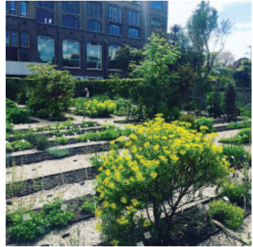
Figure 4: Clusius Garden. A model of what the hortus botanicus had been like around 1600.

The exhibition Medieval Gardens was developed in partnership with Leiden Botanical Gardens and it includes loans from other collections, including objects from the Rijksmuseum in Amsterdam, Leiden University Library and heritage institutions from various Dutch cities. The exhibition was conceptualized, and its objects selected by curator Annemarieke Willemsen. Medieval Gardens: Earthly paradises in East and West will be on display until 1 September 2019.