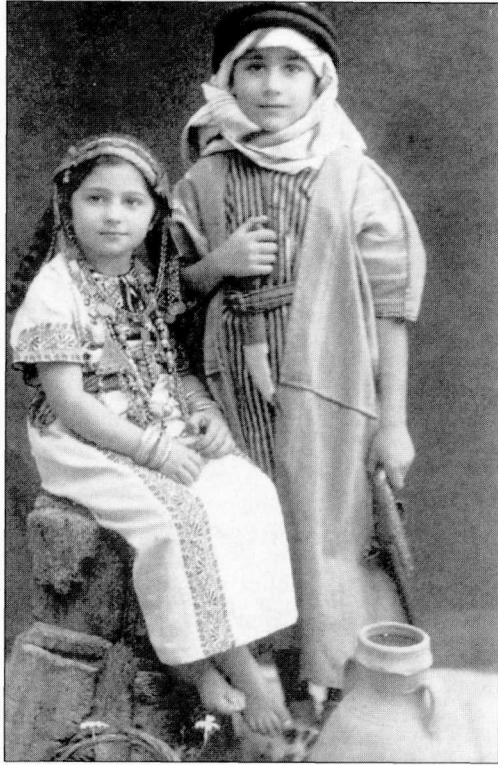
Edward Said met zijn zusje in traditionele Palestijnse kledij, Jeruzalem 1941. Uit: Edward Said, Out of place. A memoir (Londen 1999) 144.

critic should 'speak truth to power' and should not be a 'joiner', should not speak from a partisan position (an ideological 'home') but should criticise power in all its manifestations. The intellectual has to strive for freedom of opinion and expression, even if it means taking a stand against one's own government, as in the Gulf War, or appearing an irascible killjoy by speaking out against the Oslo peace accord at a time when there was considerable euphoria. The intellectual follows such a path not for personal glory but to change the moral climate. 'Speaking the truth to power', says Said, 'is no panglossian idealism: it is carefully weighing the alternatives, picking the right one, and then intelligently representing it where it can do the most good and cause the right change.' 5