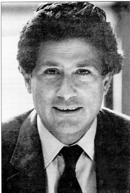
Edward Said.

guage is jargon, objects are for sale. To refuse this state of affairs is the exile's intellectual mission. 12