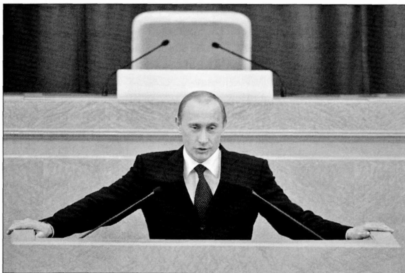
Vladimir Poetin: de redenaar.

of public language; a public language culture marked by a broader variety of voices, styles, and perspectives, which in turn were subjected to less editing and censorship.