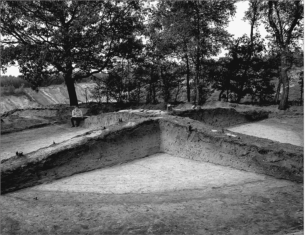
Fig. 1. Burial mound from the Late Neolithic and Early Bronze Age on mineralogically rich brown sands of the ice-pushed ridges in Lunteren (Veluwe, Central Netherlands). Both the original soil profile and the burial mound itself show a highly homogenized soil horizon of brown sand, with traces of secondary podzolization (brown podzolic) only in the top of the mound (Collection Cultural Heritage Agency, Amersfoort).

exist. When this forest vegetation was gradually cleared by human intervention in the Neolithic period and especially also in the Bronze and Iron Ages, and changed from semi-open parkland and grassy heaths into a landscape in many places dominated by heath, the net infiltration of rainwater to the subsoil increased and in the course of centuries degraded the old brown forest soil into a poor humic podzol. This process is known as ‘secondary podzolization’ (Duchaufour 2012). As a result, bioactivity would sharply decrease and, moreover, penetrate less deeply. Consequently, relics of the earlier brown forest soil still occur in the subsoil of many humic podzols at the BC horizon level. In other words: one can tell from the profile sequence of these soils that they were degraded only at a later stage (Havinga 1963; Spek 1996 and 2004).