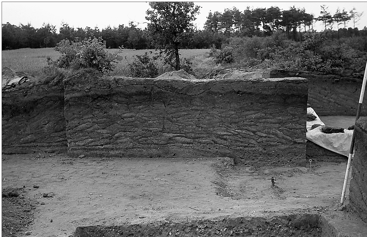
Fig. 2. Burial mound from the Middle Bronze Age on mineralogically poor cover sand in Alphen (North Brabant, South Netherlands). Both the original soil profile and the sods in the mound itself show clear characteristics of podzolization (humic podzol) (Collection Cultural Heritage Agency, Amersfoort).