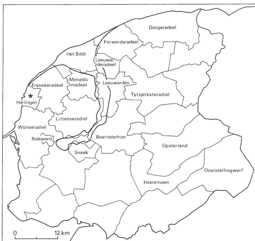
Fig. 3. The relevant municipalities in mainland Friesland, where early medieval brooches were found. Wijnaldum is indicated by an asterisk (drawing J.H. Zwier).

finds is at present not feasible. Most of the finds in the catalogues in this series were at the time relatively 'fresh'. We obtained permission to keep some larger collections for a considerable length of time, just in order to avoid confusion. It should also be mentioned that only one recognizable fake was encountered (a recent silver copy of a bronze pseudo-coin brooch already catalogued).