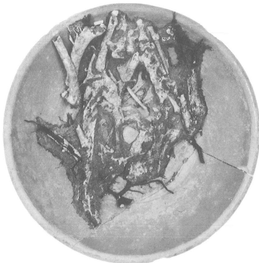
Fig. 4. TS-dish containing the articulated skeleton of a domestic fowl.

garbage and the refuse of the meal are bones of cattle: 81 % of the fragments found. The pig is the most important of the smaller domesticated farm animals constituting 14 % of the number of bones. Sheep/goat constitute 2 %. As for birds, only the domestic fowl was found: 2 %. The remaining 3 % are wild animals: aurochs, elk, red deer and boar.