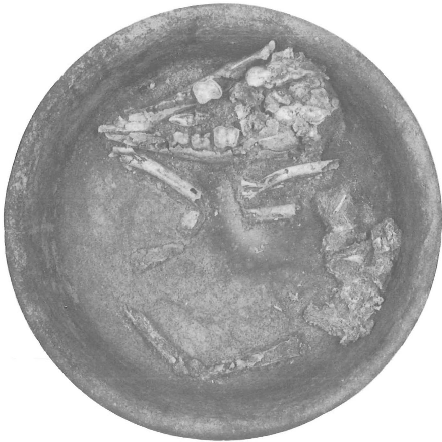
Fig. 3. Dish of coarse ware containing the remains of the head of a sucking-pig and fragments of a domestic fowl (?).