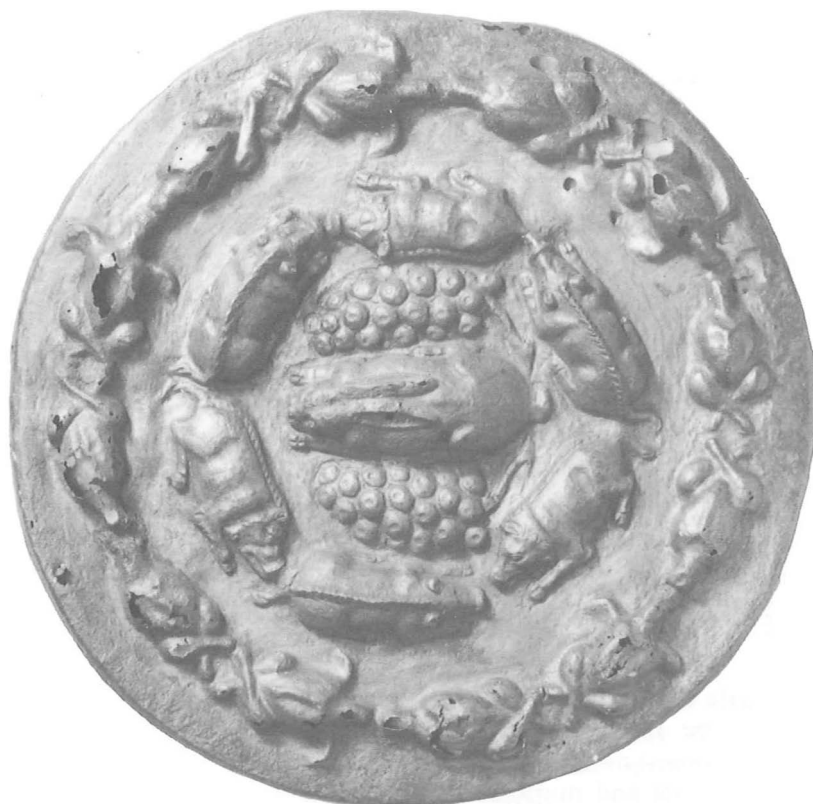
Fig. 5. The bronze lid from Mundelsheim.

found on dishes or plates and those that were simply placed in the grave. Possibly a few bones are present that accidentally came into the grave together with the earth used to cover the remains of the deceased. As in the great majority of cases the faunal material found was described as clearly belonging to the grave, this will hardly influence the overall picture of the occurrence of the various kinds of animals interred. The numbers shown in the table indicate the frequency with which the animal species occur in the graves. In the case of one grave containing faunal remains of one species on different plates, separate counts have been made for each plate. Pig is the most abundant species, with a frequency of 69 %, followed by domestic fowl at 21 %. Cattle and sheep/goat account for only 6 and 4 % respectively.