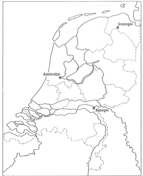
Fig. 1. The situation of Nijmegen shown on the map of the Netherlands.

During the excavation 241 graves were found of which 56 contained items of pottery on which one could expect to find bones: plates, dishes and casseroles (pers. comm. P.A.M. Zoetbrood, R.O.B.). Although during the excavation of the graves bones were often observed on the dishes, only the contents of a few dishes have been saved. The reason for this is the very poor state of conservation in the sandy soil of the cemetery. Even a slight touch caused the bones to disintegrate into dust. The contents of a few dishes were treated with a preservative during the excavation and were later carefully prepared. These dishes and their contents will be discussed further below. 'Inventory number' is abbreviated to 'IN' and terra sigillata (Samian Ware) to 'TS'. The percentages mentioned in the descriptions indicate approximately the proportion of the contents of the dishes, i.e. of the undisturbed soil containing the bones, that were conserved during the excavation. The determinations of