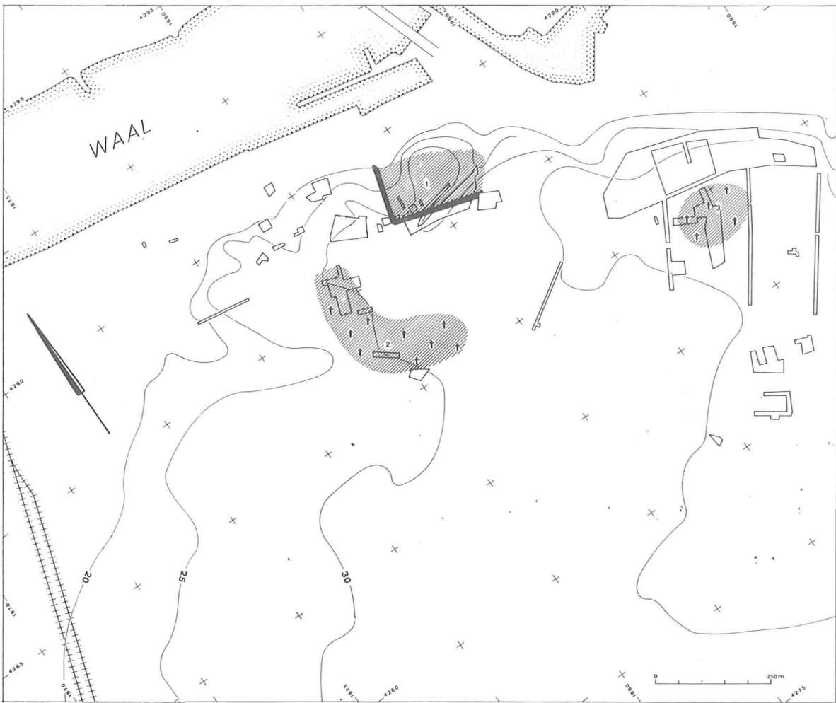
Fig. 2. Nijmegen in late-Roman times (c. A.D. 260/270-400); 1. The settlement on the 'Valkhof' and its surroundings; 2. Cemetery in the centre of the city; 3. Cemetery on the terrain of the nursing-home 'Margriet' (drawing, A.M. Nijs, R.O.B.).

incisors, the Pd3's and the Pd4's are present. The milk premolars are not worn, the Pd2's are not yet present: age between 7 and 10 weeks.