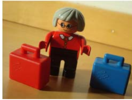
Figure 1 One picture in the elicitation task (Gavarró et al., in prep)

Note that the experimenter’s guess introduces the antecedent (here, suitcases) and thus licenses the replacement of the noun in an Q-er construction.