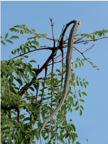
Top: Moringa concanensis tree. Middle: Moringa concanensis flower. Bottom: Moringa concanensis tree with pod.